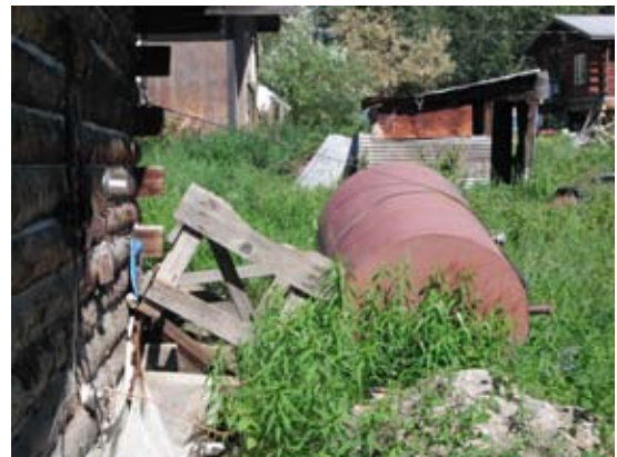
Topped Oil Tank

system to 6" by 6" pressure treated wood timbers or railroad ties on the ground. Again, in flood areas, fasten the timbers with ground anchors and make certain that the tank is banded to the support stand. safety with a containment area under the tank. A soil or sand berm with a fuel resistant liner will catch spills before the oil enters the ground, groundwater, wells, septic systems, drainage ditches and so on. Finally, try to ensure that the tank fill cap and vent are located above the level of any possible flood.