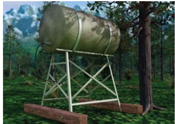
Secured Elevated Oil Tank

Steel support systems are available from many fuel supply companies and other sources. They are generally fabricated with welded angle iron or heavy gauge pipe to provide rigidity and strength. To be safe during an earthquake or fast moving flood, a steel tank support must be designed with a wide footprint and good diagonal bracing. Stability can also be improved by securely bolting the steel support