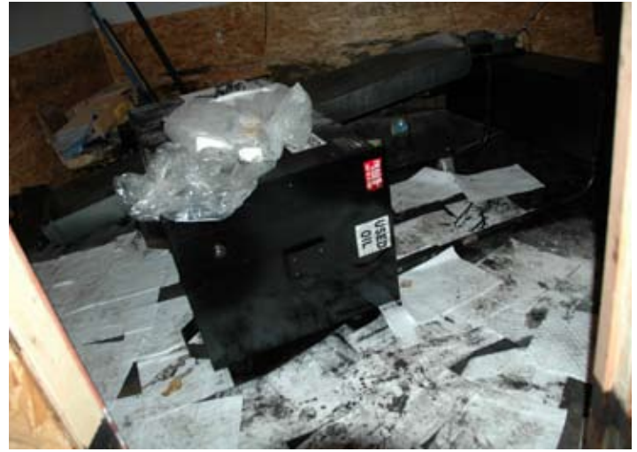
Used oil container toppled during flood; it could be elevated and anchored.