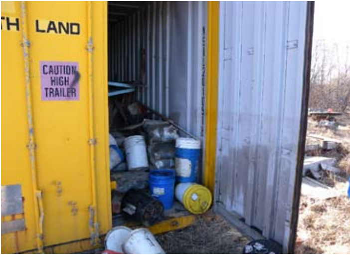
Flooded hazardous materials container could be relocated or elevated.